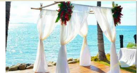
NP Weddings and Events