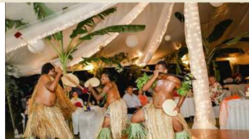
Manakilagi Culture Group