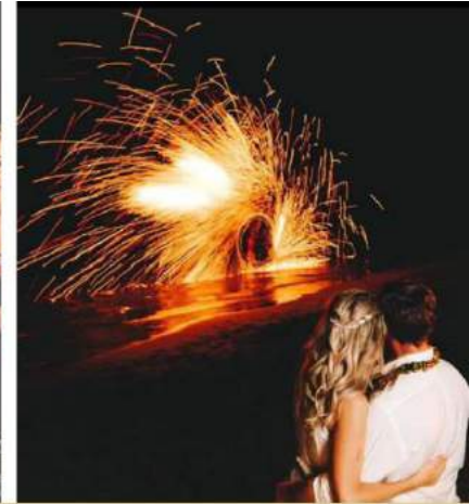
MANAKILAGI CULTURAL GROUP