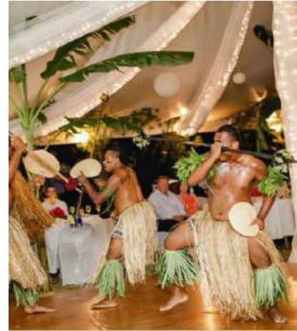
MANAKILAGI CULTURAL GROUP

Here are some of the best packages to create those memories.