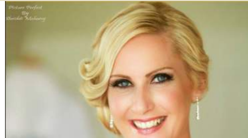
Hair & Make-Up Perfectionist