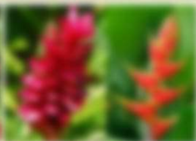
Flowers & Leaves

These flowers are large and bright red, often found in clusters. They are typically found in the wild and are a popular choice for gardeners.